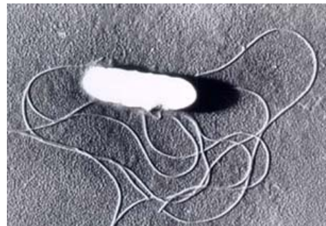
Fig 1. A pathogenic Listeria .

A broad range of pathogenic (= disease causing) micro-organisms cause numerous health problems to humans and animals. Some examples are for instance Camphylobacter , Candida , Clostridium , E. coli , Legionella , Listeria (Fig 1), Salmonella , Staphylococcus (MRSA, hospital bacterium) and Streptococcus . In addition to the dangers induced by these organisms in each of our personal environment, they are also responsible for a large number of economic losses due to increased animal mortality (breeding programs), reduced productivity (food industry) and increased health care costs (hospital bacterium, dust mite). Using antibiotics and disinfectants, these problems could easily be hold in hand during the past decennia. However, the past years a rapidly increasing resistance against these 'miracle agents' has been noticed in all sectors, to such an extent that a radical new approach is eminent.