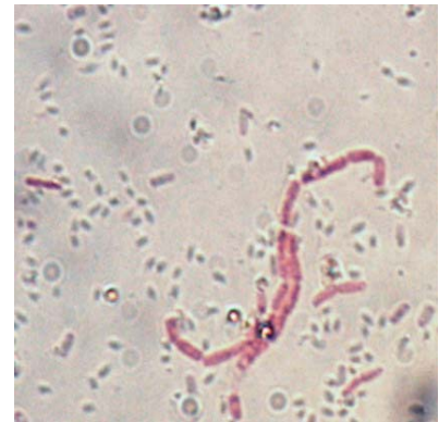
Fig 3. Red cells are active probiotic PIP bacteria. Gray dots represent PIP spores.

In contrast to the rather stable and protective situation in the gut, environmental conditions may strongly fluctuate, thereby imposing strict survival demands to the applied bacteria. All PIP products contain probiotic bacteria as a crucial ingredient, which possess the unique property of sporulation (Fig 3). This process makes it possible for these bacteria to survive harsh conditions and regain their activity as soon as environmental parameters improve. Without this feature it would be impossible to apply probiotics successfully for environmental or industrial process applications.